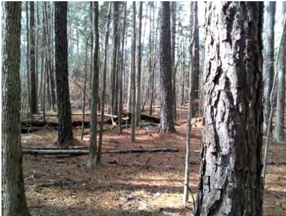
Photo #5 Easternmost Corner facing W (Note: mountain bike boardwalk not within Conservation Area)