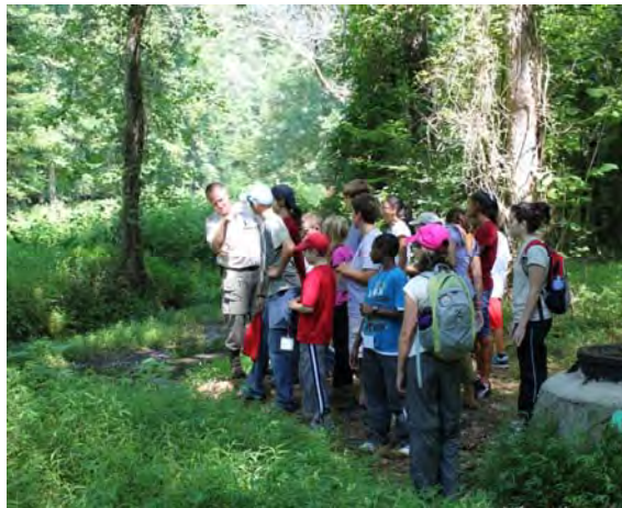
Campers with CN Staff