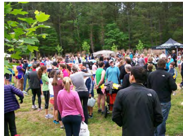
Philosopher's Way Run