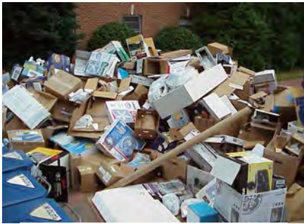
Hinton James, 2000

Before we put in this effort, this is what move-in used to look like: