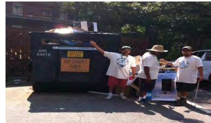
Ehaus Crew keeping it clean in 2014!

This year, the list of team members that pitched in on this effort are: