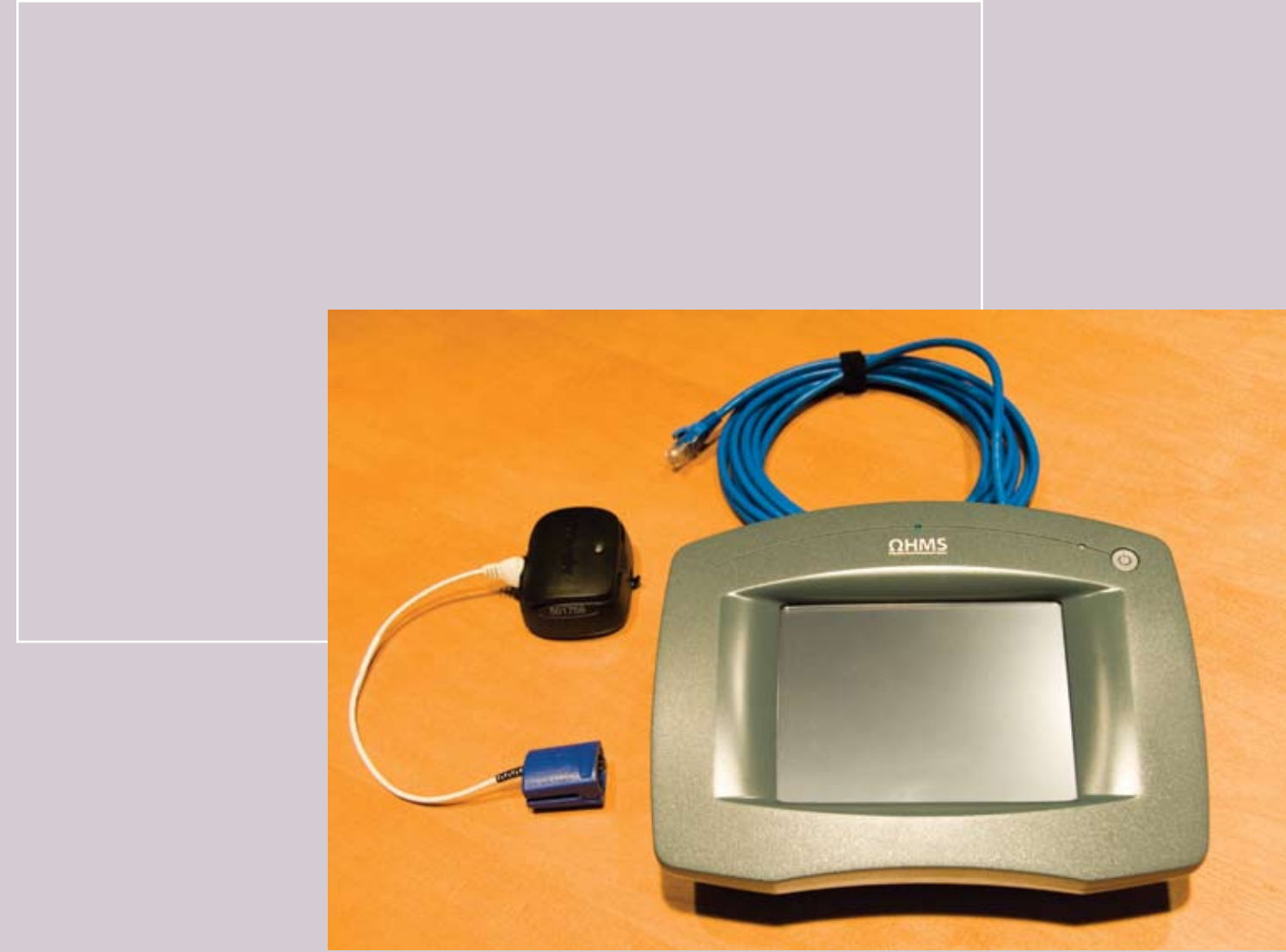
Outpatient Hospital Monitoring System

The Renaissance Computing Institute is a collaborative research venture between UNC-Chapel Hill, Duke University, NC State University, and the state of North Carolina.