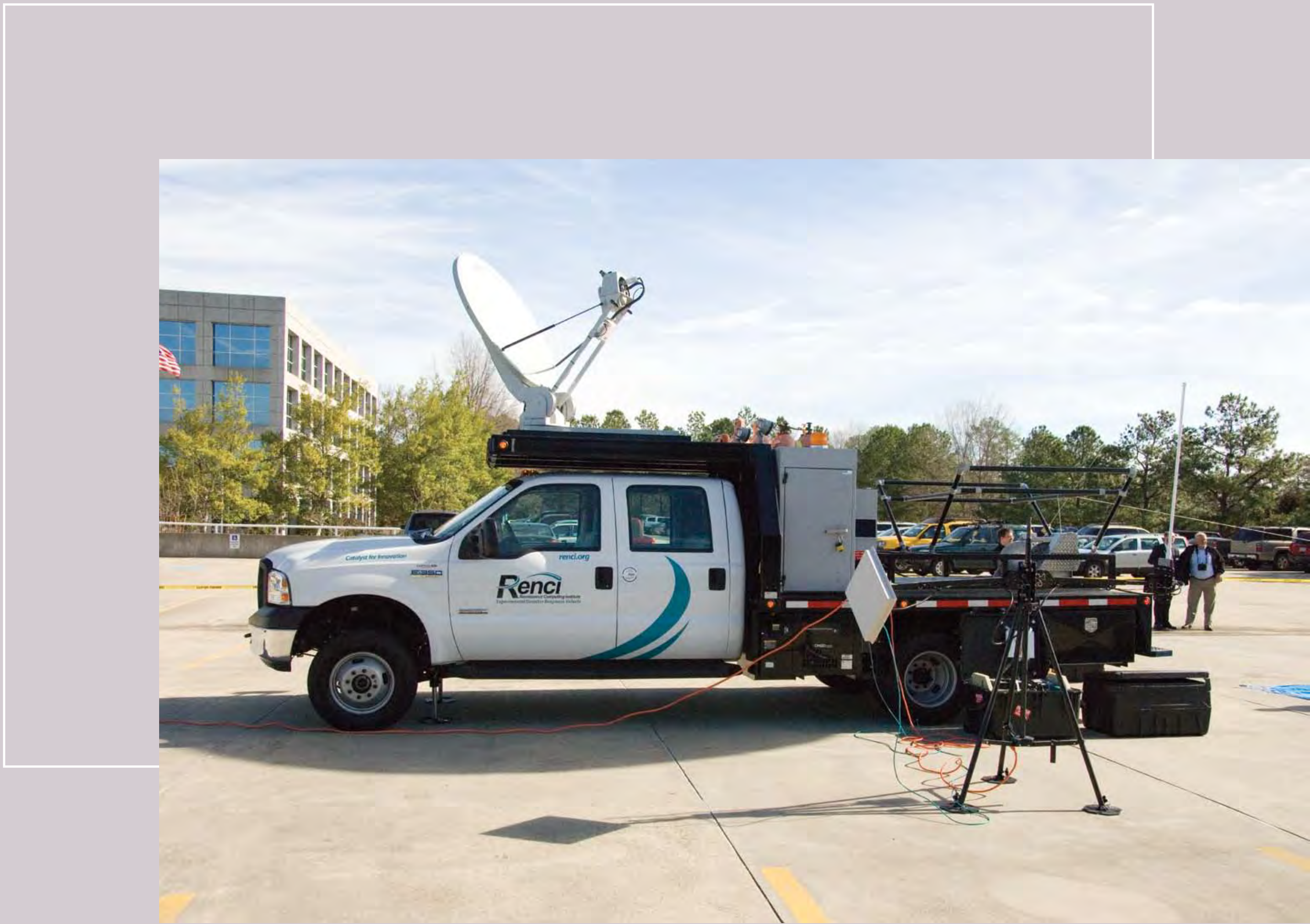
Experimental Disaster Research Vehicle