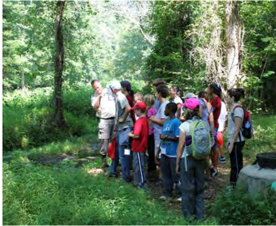
Campers with CN Staff