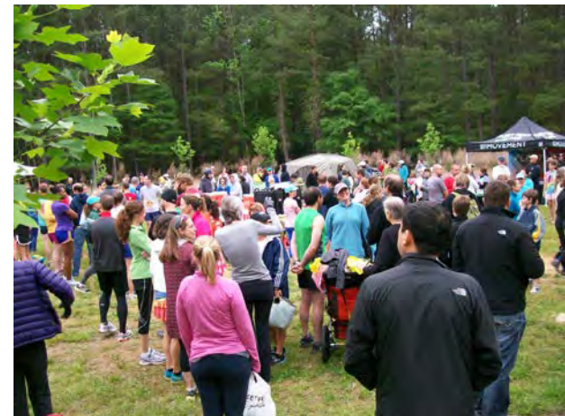
Philosopher's Way Run