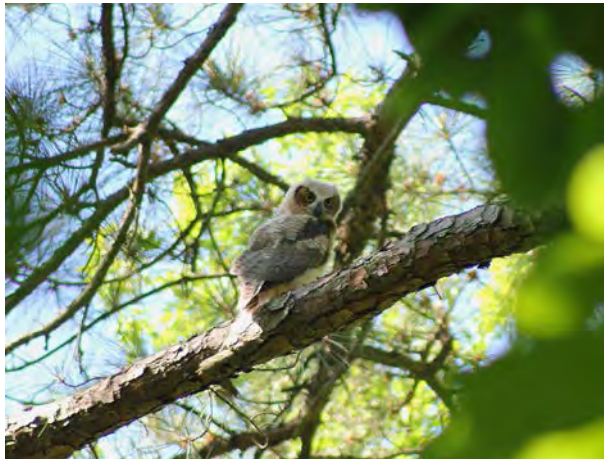
Great Horned Owl Fledgling