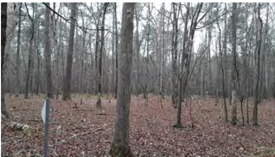
Midpoint along boundary. Facing SSW.