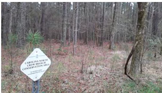
View from corner along boundary. Facing SSE. Taken 3/24/2021 by Caroline Durham.