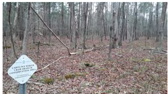
View from corner along boundary. Facing WNW. Taken 3/24/2021 by Caroline Durham.