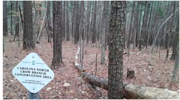
View from corner along boundary. Facing S. Taken 3/24/2021 by Caroline Durham.