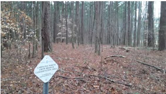
View from corner along boundary. Facing W. Taken 3/24/2021 by Caroline Durham.