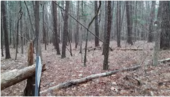
View from corner along boundary. Facing W. Taken 3/24/2021 by Caroline Durham.