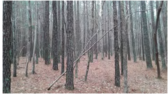
View from corner along boundary. Facing NW. Taken 3/24/2021 by Caroline Durham.