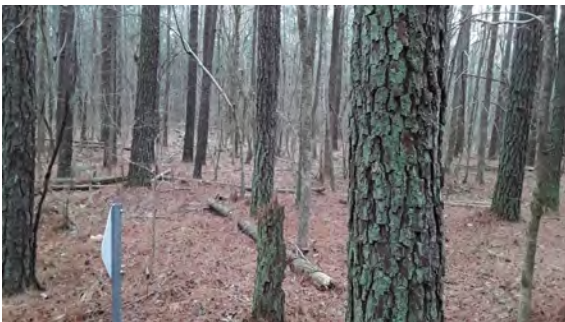
View from corner along boundary. Facing SSE. Taken 3/24/2021 by Caroline Durham.