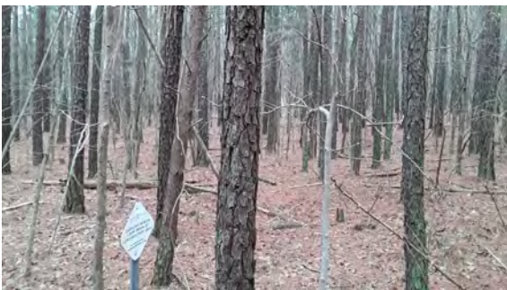
Midpoint along boundary. Facing WSW.