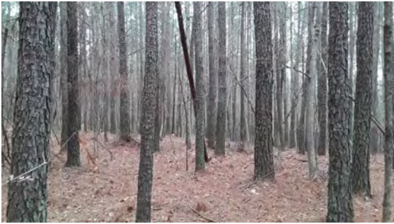
View from corner along boundary. Facing NNE. Taken 3/24/2021 by Caroline Durham.