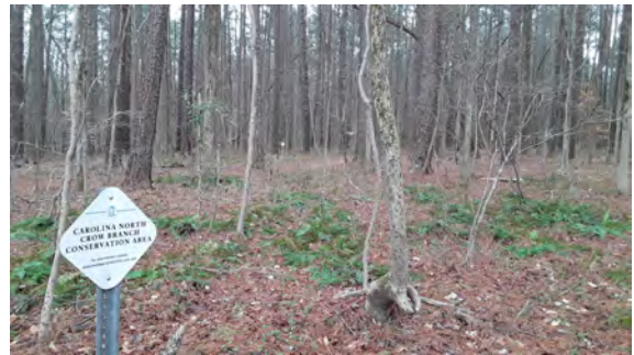
View from corner along boundary. Facing SSW. Taken 3/24/2021 by Caroline Durham.