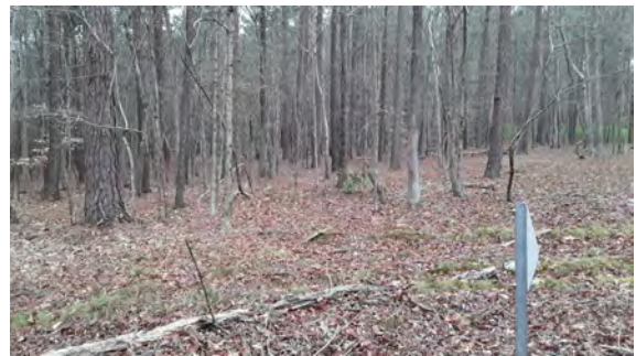
Midpoint along boundary. Facing NNW.