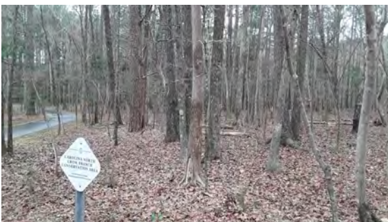
View from corner along boundary. Facing SW. Taken 3/24/2021 by Caroline Durham.