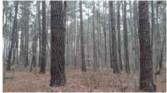
Midpoint along boundary. Facing NE.