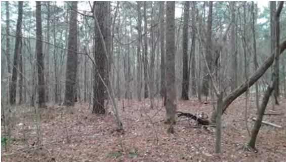
Midpoint along boundary. Facing SSE.