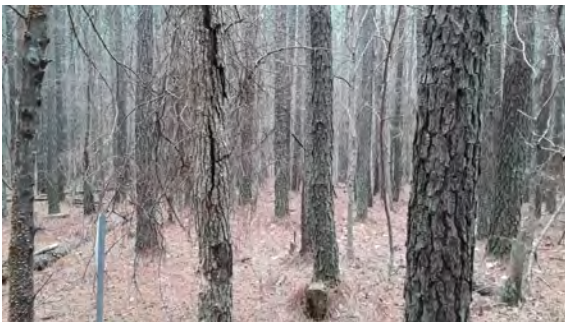
Midpoint along boundary. Facing NNW.