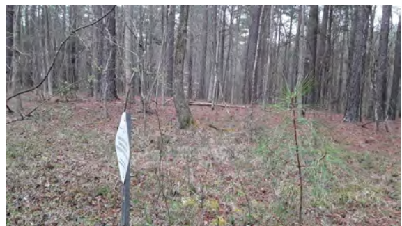
View from corner along boundary. Facing NE. Taken 3/24/2021 by Caroline Durham.