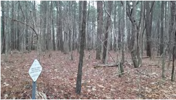
Midpoint along boundary. Facing NNW.