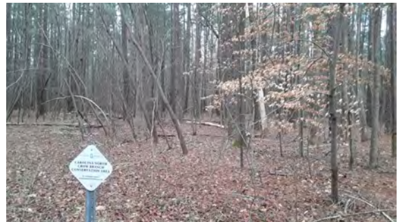
View from corner along boundary. Facing SSW. Taken 3/24/2021 by Caroline Durham.