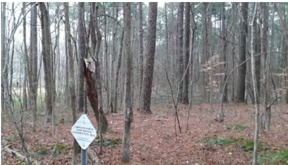
View from corner along boundary. Facing ESE. Taken 3/24/2021 by Caroline Durham.