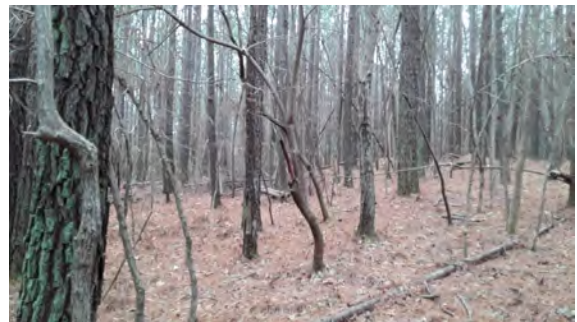
Midpoint along boundary. Facing ESE.