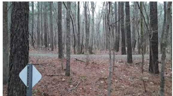
View from corner along boundary. Facing N. Taken 3/24/2021 by Caroline Durham.