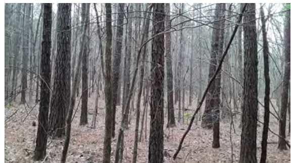
Midpoint along boundary. Facing SE.