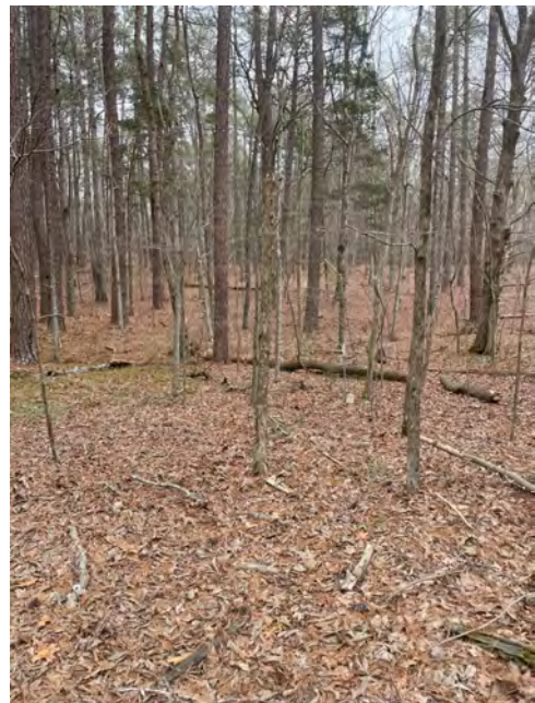
Facing ESE.