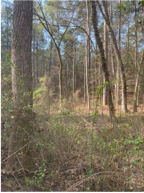
Facing SSW.