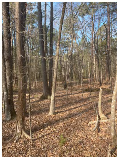
Facing WSW.