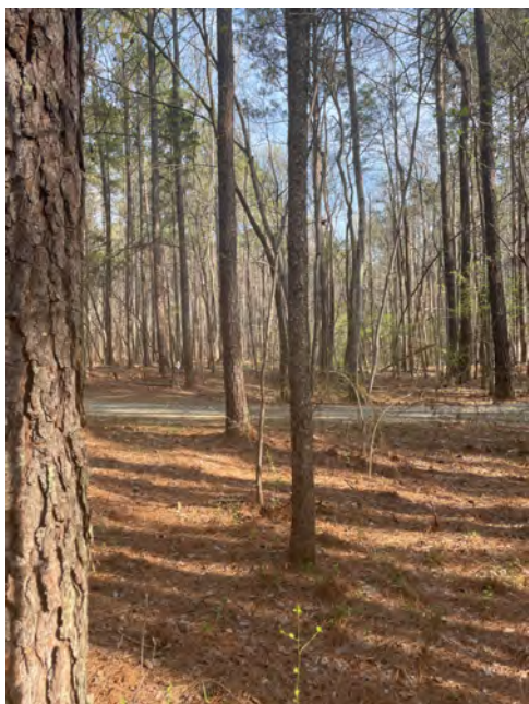
Facing NNE.