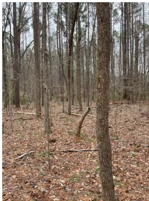
Facing NE.