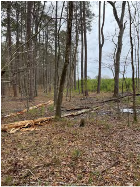
Facing ESE.