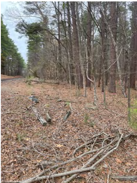
Facing NNE.