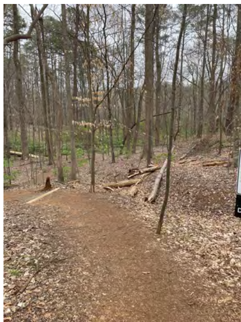
Facing E.