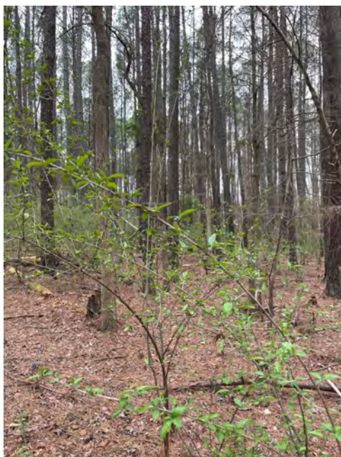
Facing W.