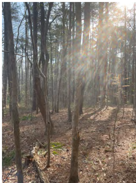
Facing ESE.