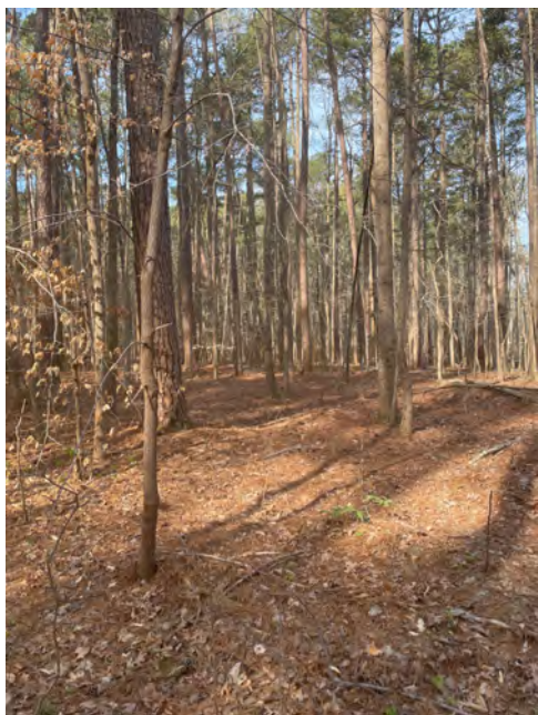
Facing W.