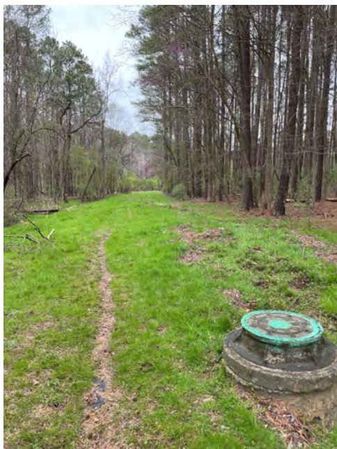
Facing NE.