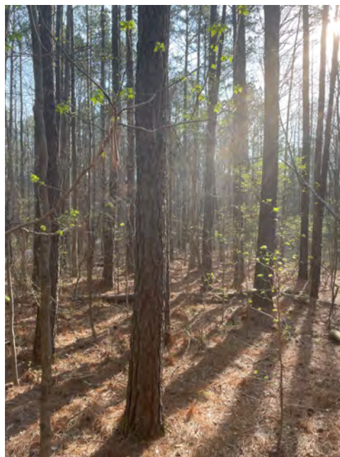
Facing ESE.