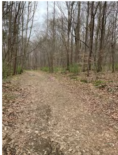
Facing ENE.