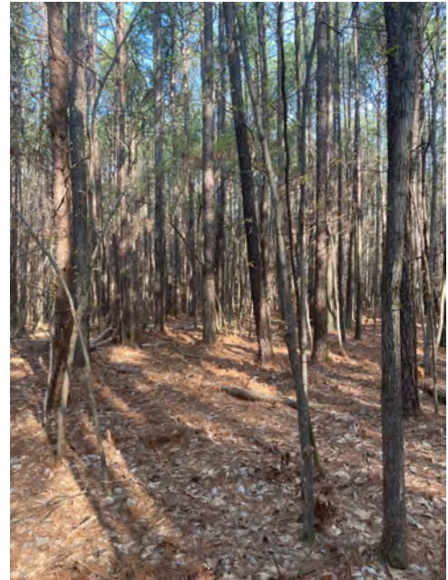
Facing NNW.