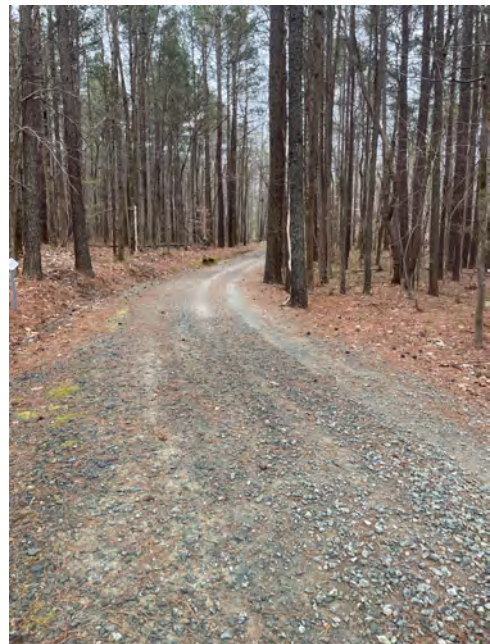
Facing S.