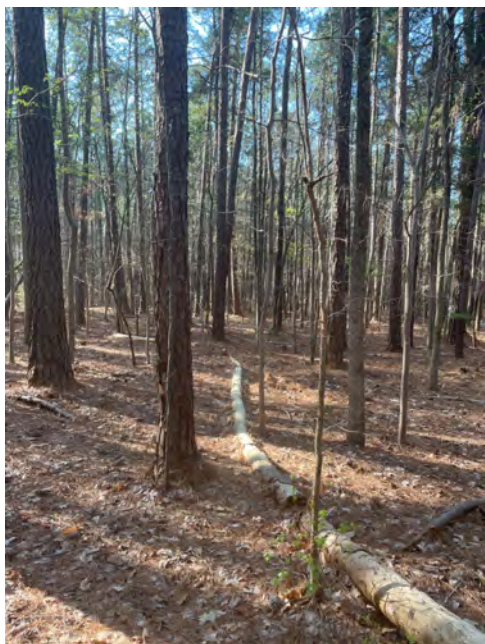
Facing S.