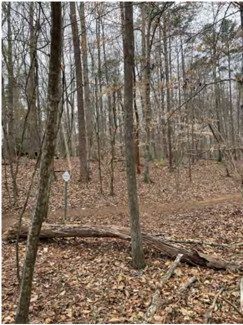
Facing WNW.