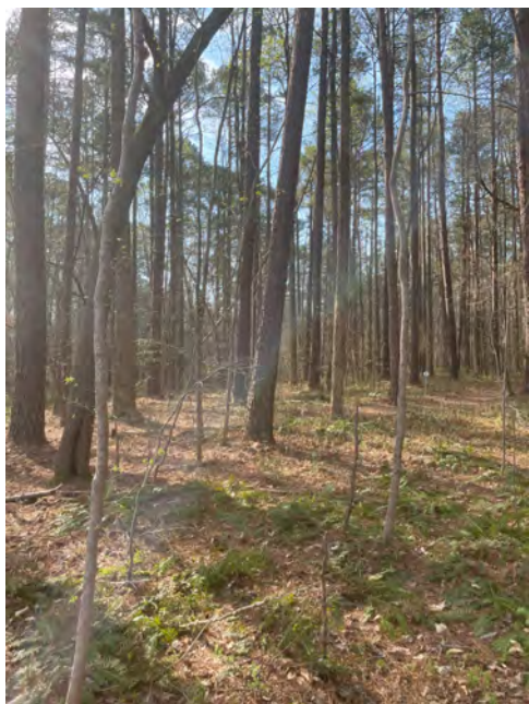
Facing S.