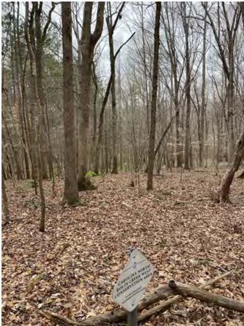
Facing WNW.