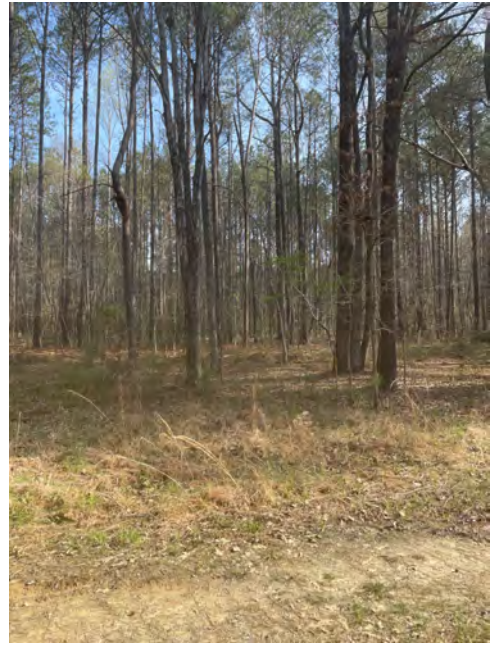
Facing NE.