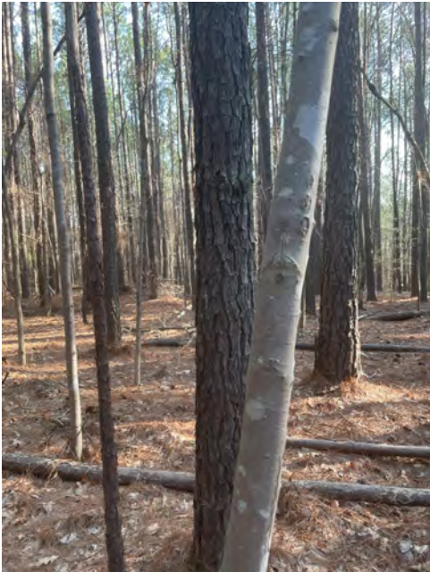
Facing NE.