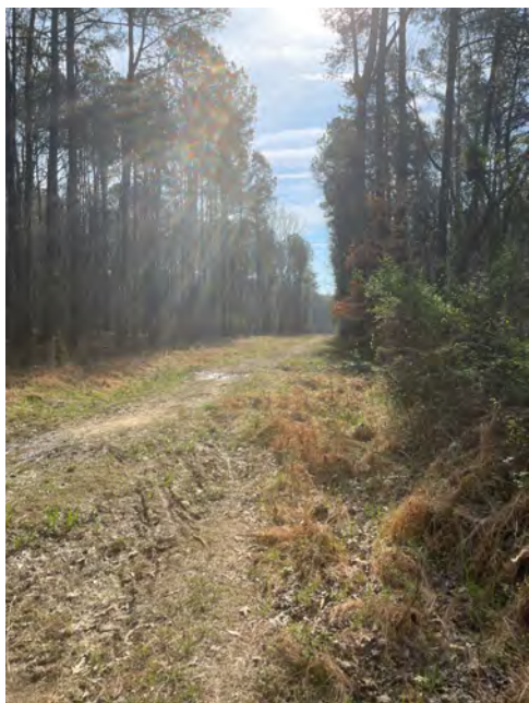
Facing ESE.