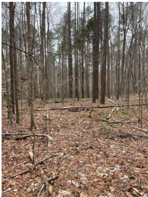
Facing NW.