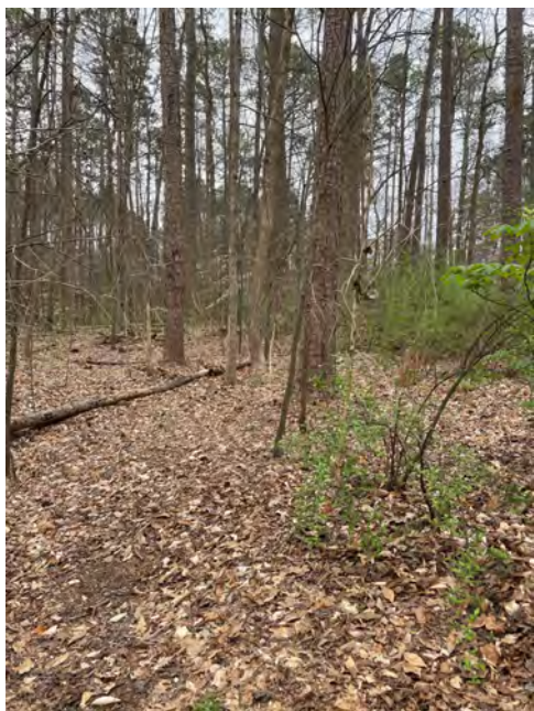
Facing SSW.