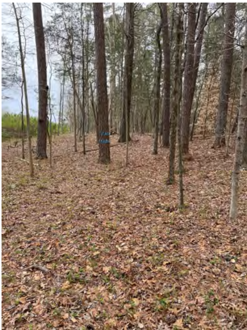
Facing SSW.