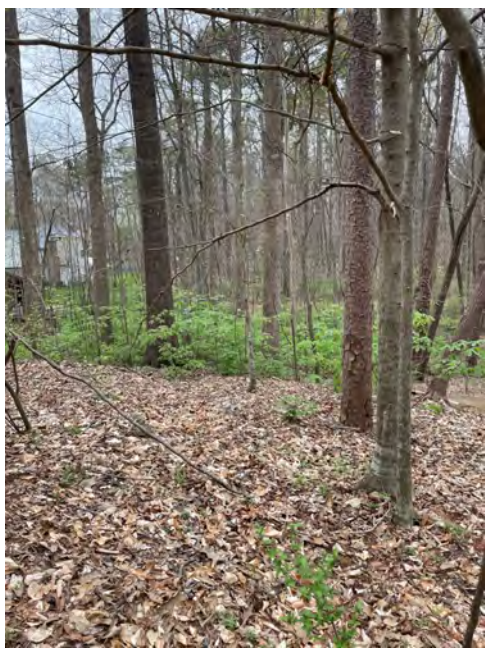
Facing NNE.