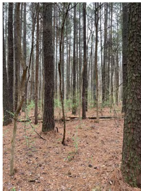
Facing E.