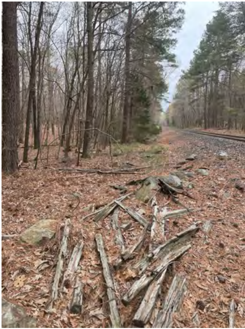
Facing S.