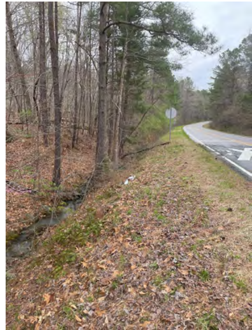
Facing NNW.