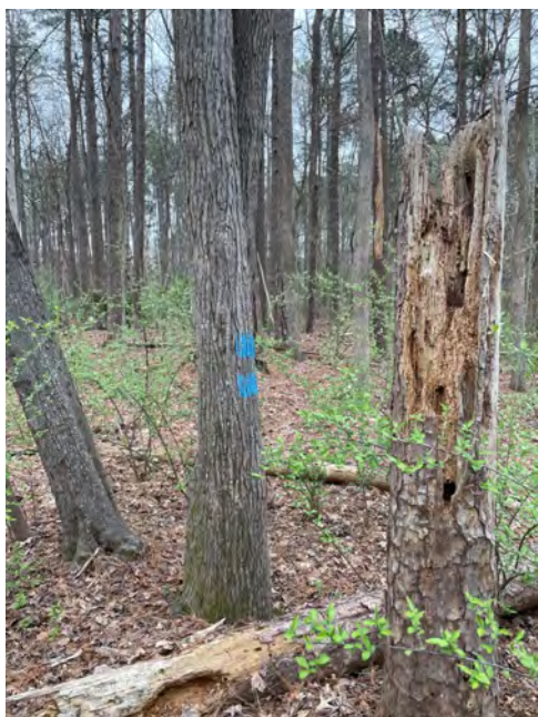
Facing E.