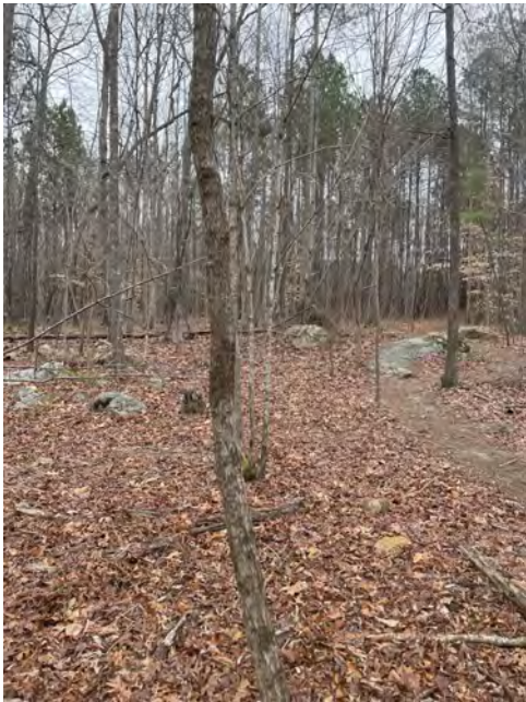
Facing ENE.