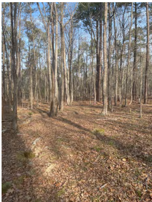
Facing NNW.