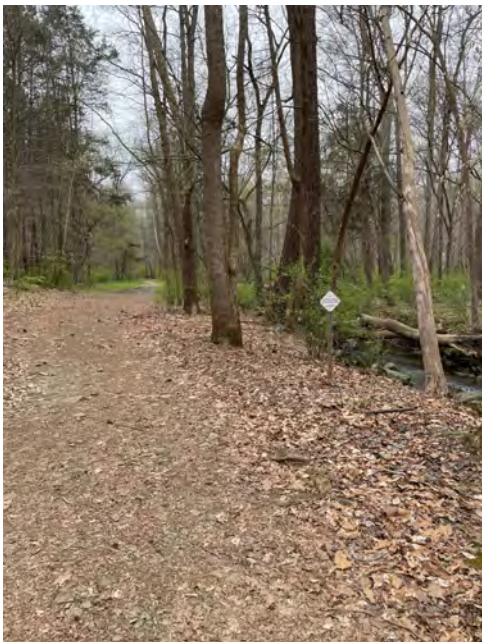
Facing WSW.