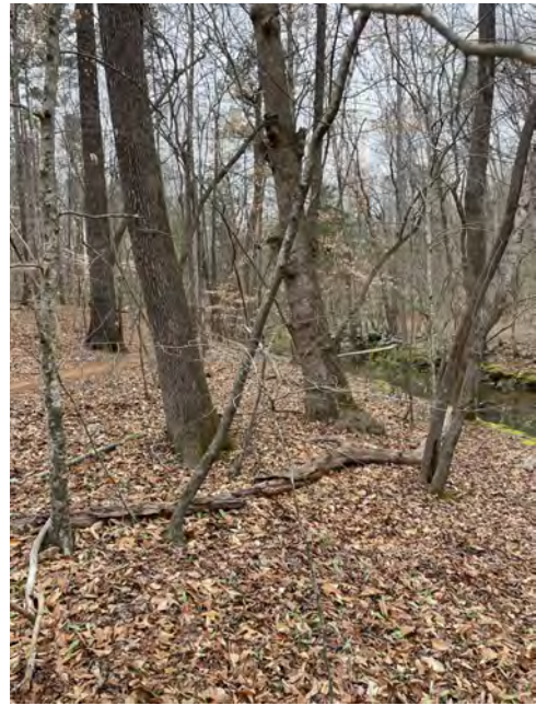
Facing NNW.