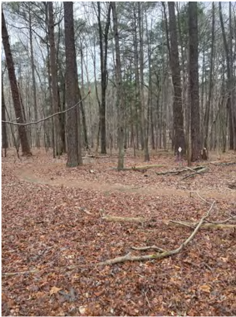
Facing W.