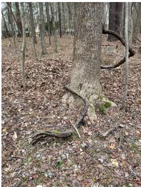
Yard waste Facing NNW.