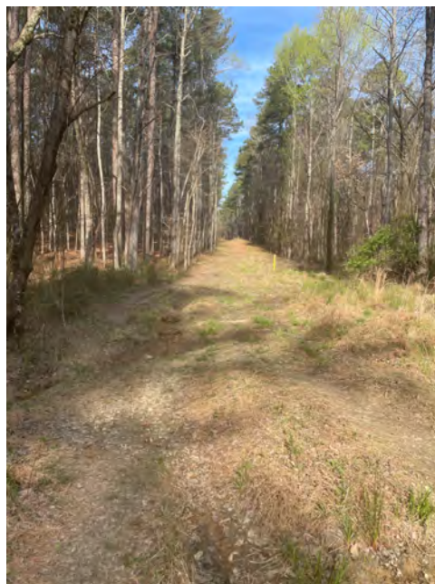
Facing NW.