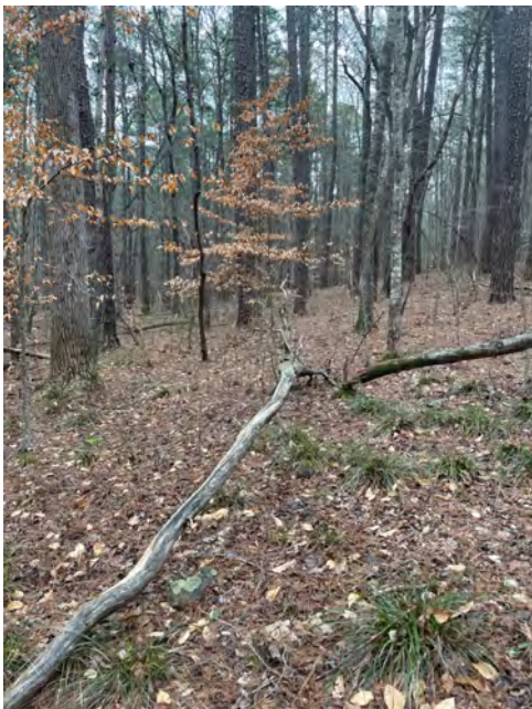
Facing ENE.