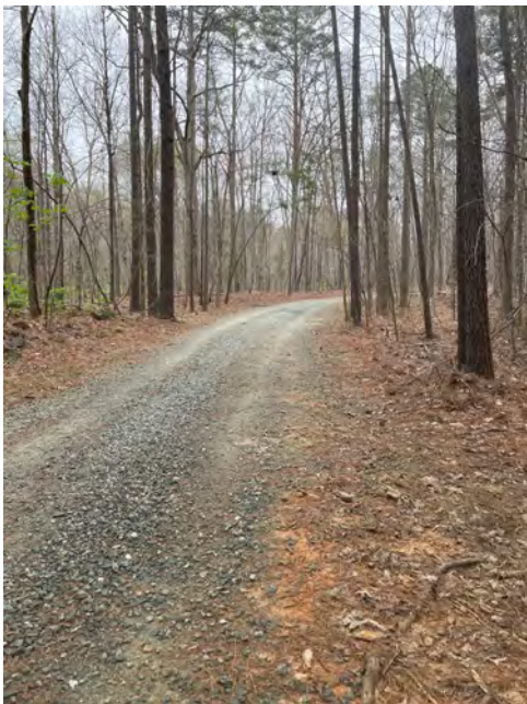
Facing NNW.