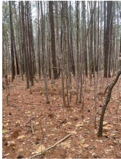
Facing WSW.