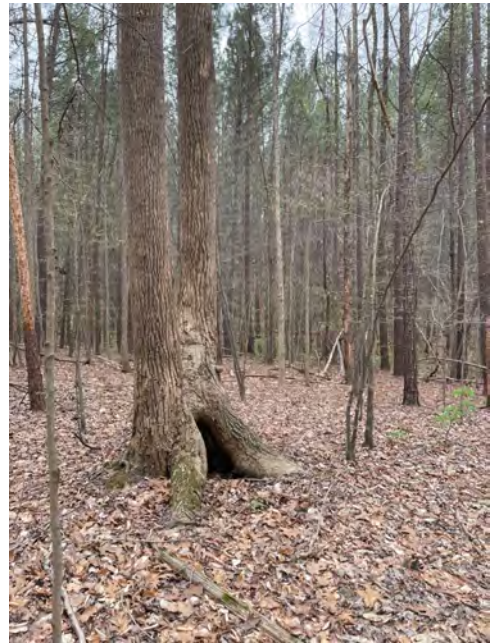
Facing SSW.