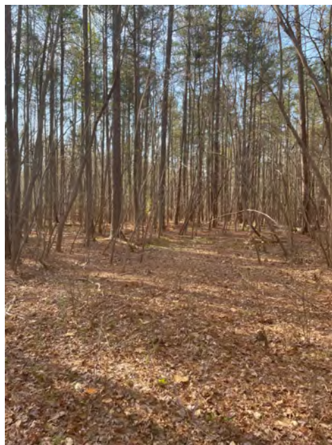
Facing S.