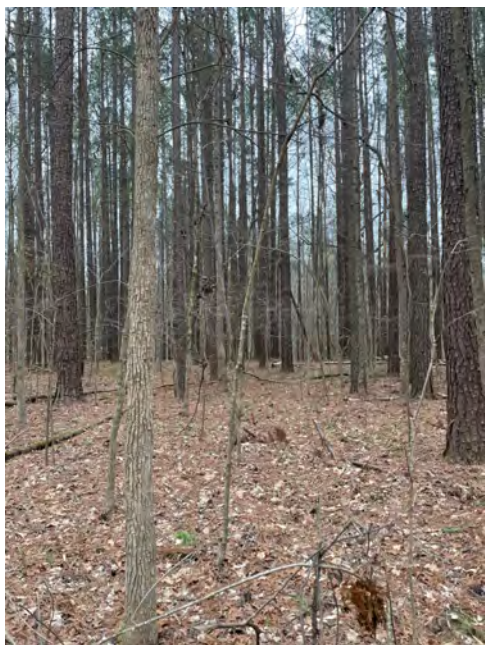
Facing N.