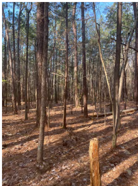
Facing WSW.