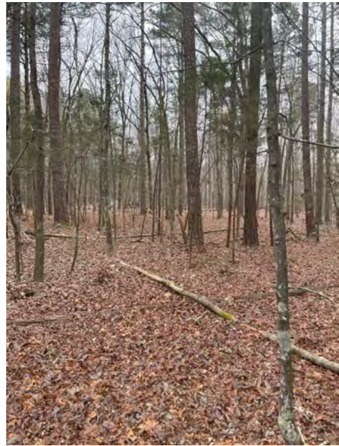
Facing SSW.