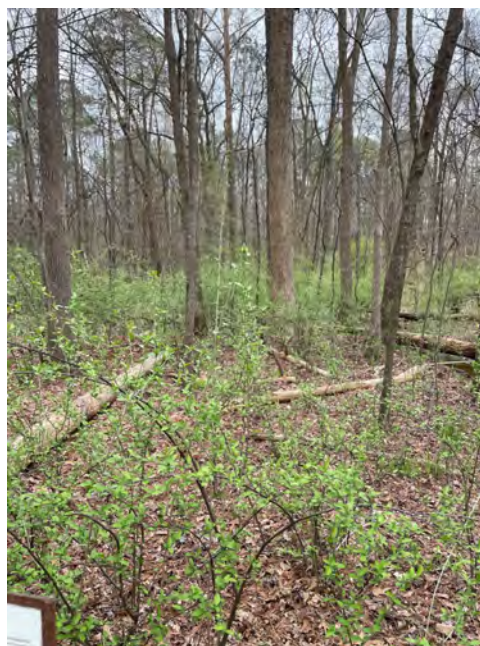
Facing SE.