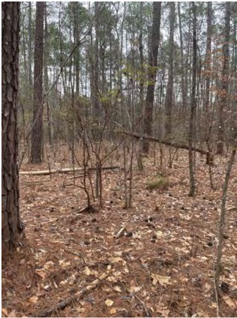
Facing ENE.