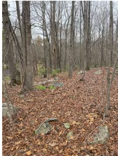
Facing N.