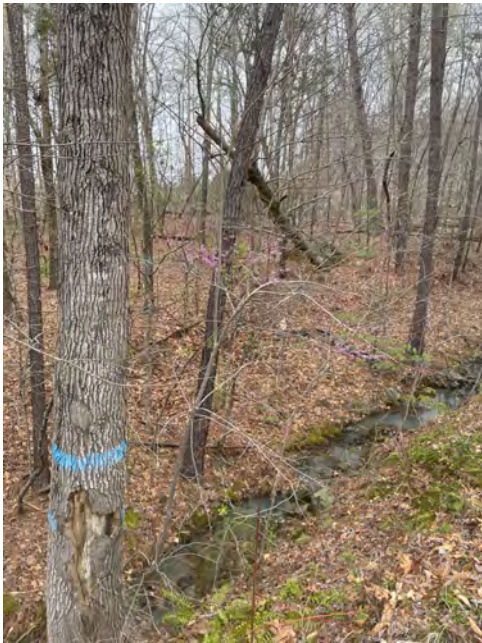
Facing NW.